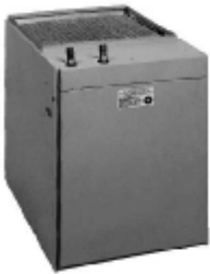
Variable Speed Air Handler with Controller